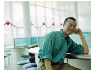
Click here to try out demonstration system

A demonstration is available online at the link below, or contact us for more info.