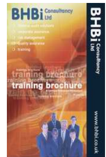
Latest Course brochure available on website

Demo Link to SMILE www.bhbi.scribestudio.com/custom/8860/index.jsp